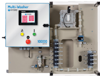
Multi-Washer 10000 Series 1-Channel